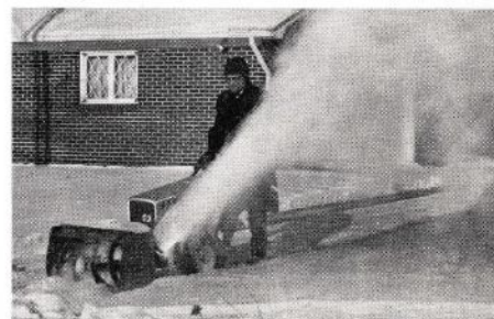
Move snow fast! Two-stage, no-clog Snow blower—one of five snow removal tools powered by the Gravelly Convertible!

GRAVELLY TRACTOR DIVISION Studebaker CORPORATION