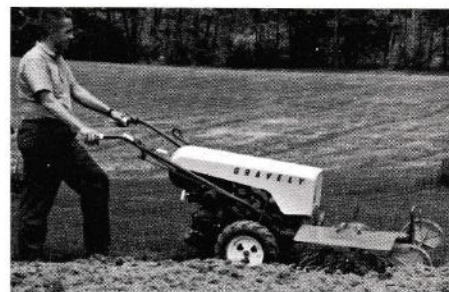
Power plow and cultivate with Gravelly's New Convertible Riding-walking Tractor!

See the NEW Gravelly Convertible work on your grounds, under your conditions, before you buy. Write or call your Gravelly Dealer for free demonstration . . . today!